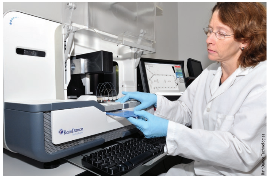
The RainDance RDT 1000 can be used in PCR-based sequence capture applications.

In November 2007, three articles describing new capture and enrichment protocols for multi-megabase genomic regions appeared in the pages of Nature Methods . Two of the approaches relied on array-based hybridization capture methods 1,2 , and the third took