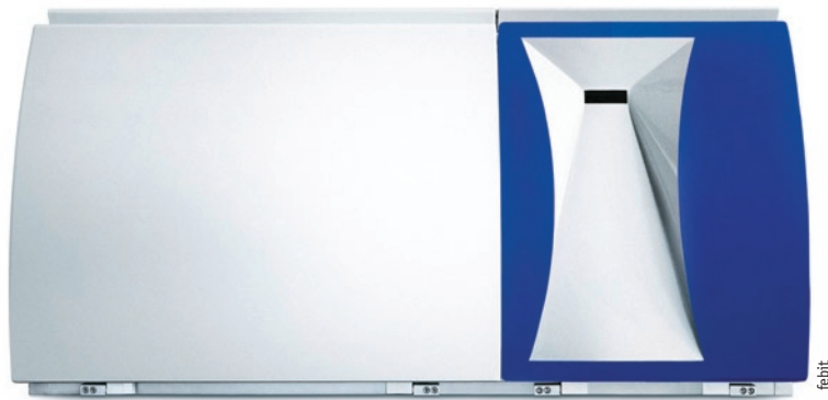
The febit approach to sequence capture relies on the use of microfluidics and multiplexed arrays.

The theory behind the RainDance approach to PCR is simple: one droplet will contain a single forward and reverse primer pair and a second droplet will contain the PCR mix and DNA template of interest. The challenge for engineers at RainDance was to create a reliable microfluidic platform that could move and subsequently merge these droplets together in a high-throughput manner. They accomplished this by infusing the primer droplets in one microfluidic channel and the template droplets in another. Application of an electric field induces the two droplets to come close together and eventually merge into a single droplet, resulting in the creation of millions of individual PCRs in individual droplets over the course of an hour. At the moment, Lambert says the RainDance approach is capable of amplifying up to 4,000 PCR products per sample and processing eight samples per day on a single instrument.