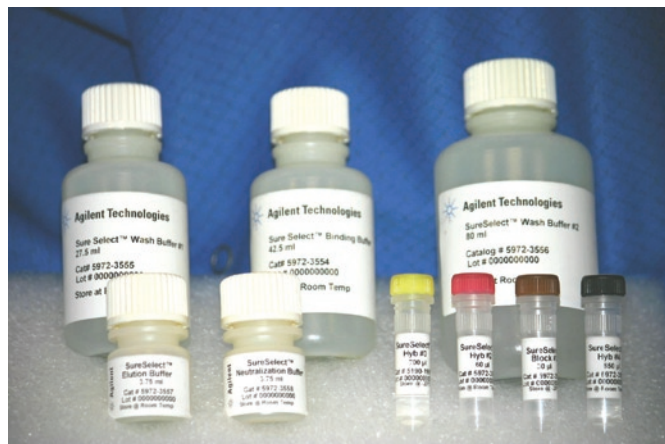
The commercialization of sequence-capture technologies and approaches has occurred in a very short period of time.

But one solution-based approach that is seeing broader adoption at the moment was developed by researchers at the Broad Institute 7 and is now being commercialized through Agilent Technologies. In this approach, which Agilent calls the SureSelect Target Enrichment System, biotin-labeled RNA 'bait' probes are used to 'fish' specific DNA sequences out of a 'pond' of DNA fragments. When the RNA is hybridized to a fragmented genomic library, DNA and RNA